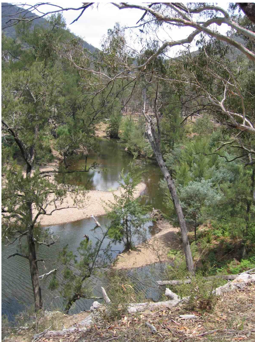
Pictured above is a photo taken from the Turon River in NSW