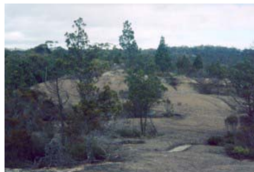
Some more glimpses of the NSW Champs in October