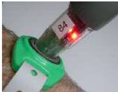
A punch and a tag.....

When you visit a control you record your visit by inserting the punch into the tag. You must hold the punch in the tag until the red light flashes to indicate that your visit was recorded.