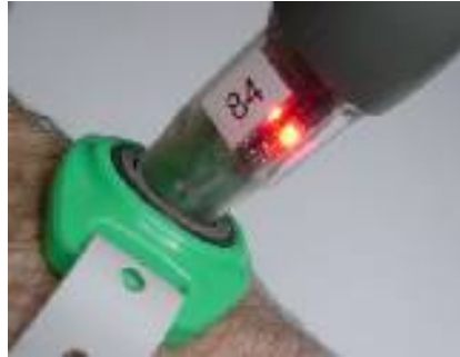
A punch and a tag.....

When you visit a control you record your visit by inserting the punch into the tag. You must hold the punch in the tag until the red light flashes to indicate that your visit was recorded.