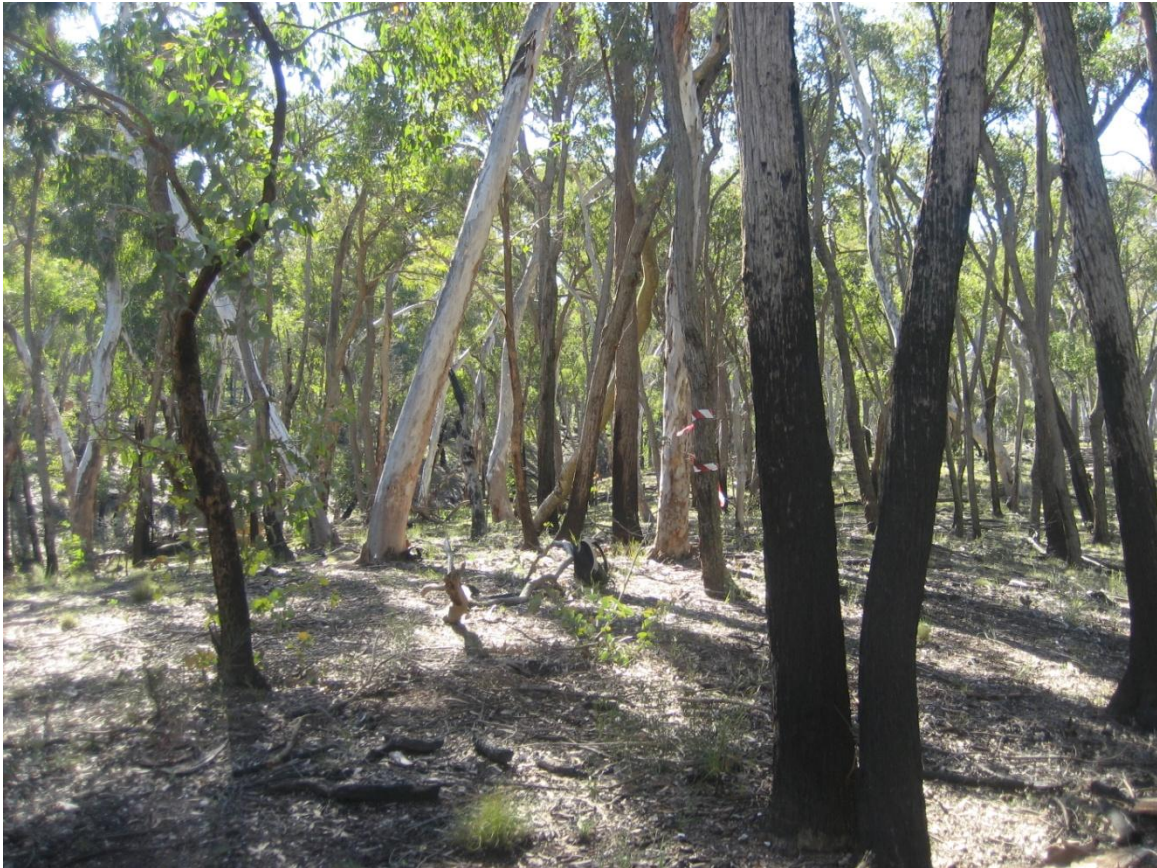
#44 A very tiny knoll