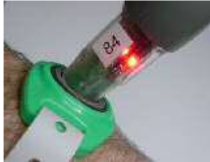
A punch and a tag.....

When you visit a control you record your visit by inserting the punch into the tag. You must hold the punch in the tag until the red light flashes to indicate that your visit was recorded.