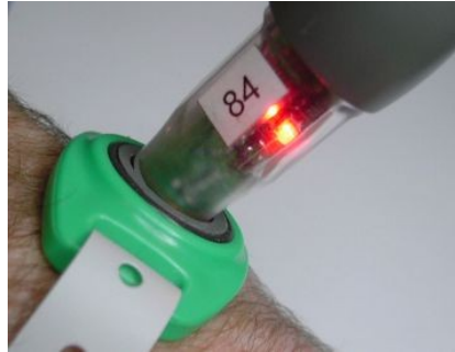
A punch and a tag.....

When you visit a control you record your visit by inserting the punch into the tag. You must hold the punch in the tag until the red light flashes to indicate that your visit was recorded.